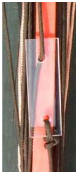
Guy Tensioner

Fabricate guy tensioners from short pieces of plastic or wood with three holes drilled in it. Depending on your rope size, it may tighten with just two holes, or you may need a third if your rope is very small. See the pictures for my tensioners.