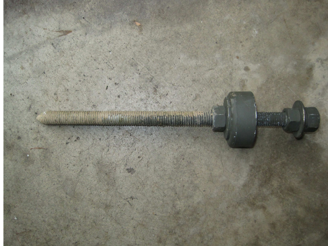
Base Spike Detail, PVC Version

On the short section that protrudes inside the end cap, mount a single fender washer near the end with two nuts and a lock washer. Then turn down this fender washer on a grinder until it's diameter just fits inside the 1½" PVC pipe section. This will provide additional support to the pipe and likely allow it to stand up by itself when attached to the base spike long enough to get the dipole wires tensioned as guy wires.