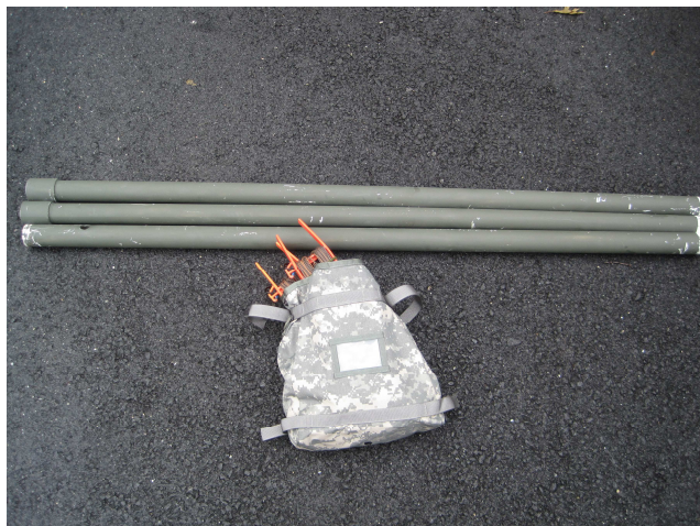
Complete Antenna, PVC Pipe Version (Note that PVC couplers are only on two sections of the pipe, not all three.)