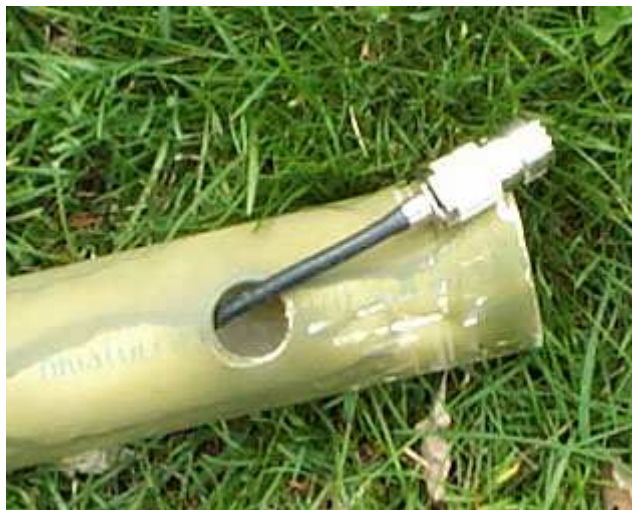
Feedline Detail

For the PVC version, cut three 5' sections of 1 \frac{1}{2} " PVC pipe. Glue a coupler (union) on one end of two of the sections. On the bottom section, drill a hole near the bottom large enough through the side to accommodate a PL-259 connector passing through. This is where the feedline will exit the center mast. Drill this hole just above where the ground spike's washer fits inside the pipe (see below). NOTE – if using the fiberglass masts, don't drill the hole. The folding paddle base has a hole in the center and the feedline will simply exit the bottom of the mast.