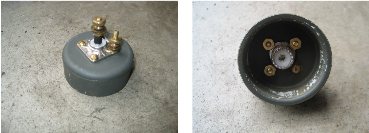
Top Cap Detail – PVC Version

Fabricate two terminals for the dipole into a 1½" PVC end cap using #6 brass screws, nuts, and knurl nuts. Inside the PVC end cap, connect an SO-239 dangling on two short pieces of wire connected to the brass screws that protrude through the top. This end cap will pop on the top section of pipe, and allow the feedline's PL-259 to attach inside.