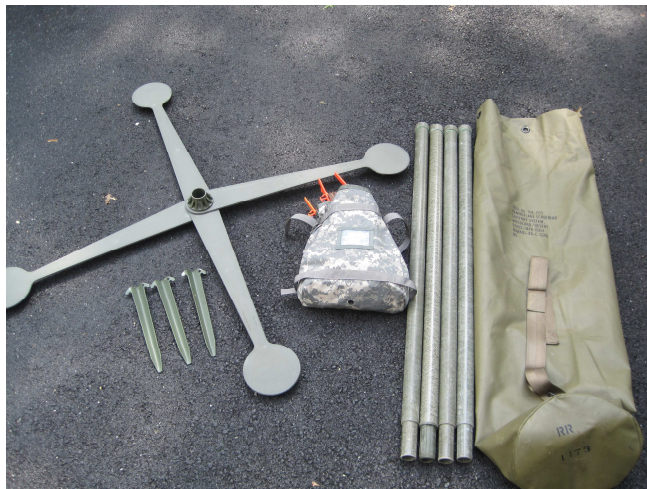
Complete Antenna, Fiberglass Pole Version